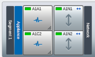
Monitor mode — network traffic going to the tool from both directions, heartbeat detected.

The Copper Bypass TAP provides heartbeat functionality to automatically detect a tool failure. It does this by inserting heartbeat packets into the network traffic going to the network tool from both directions. The Copper Bypass TAP then continually monitors the attached devices at very short intervals. If the expected number of packets are not returned within the specified interval, the blade assumes that a failover condition has occurred and quickly switches to Bypass mode. While in Bypass mode, network traffic is diverted around the unresponsive tool reducing the risk of lost network data. If the condition that caused the port to switch to Bypass mode corrects itself within the specified timeframe, then the mode could automatically switch back to the normal Monitor mode. Alternatively, users can specify that the network ports remain in Monitor mode during failover, but their transmit signals are disabled. The disabled transmit signals notify any external monitoring device that a failover condition has occurred for those network ports. This allows the external monitoring device to reroute the network traffic away from the current network ports.