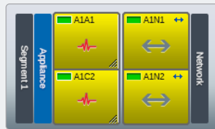
Failover condition — faulty heartbeat link detected and switches to Bypass mode.